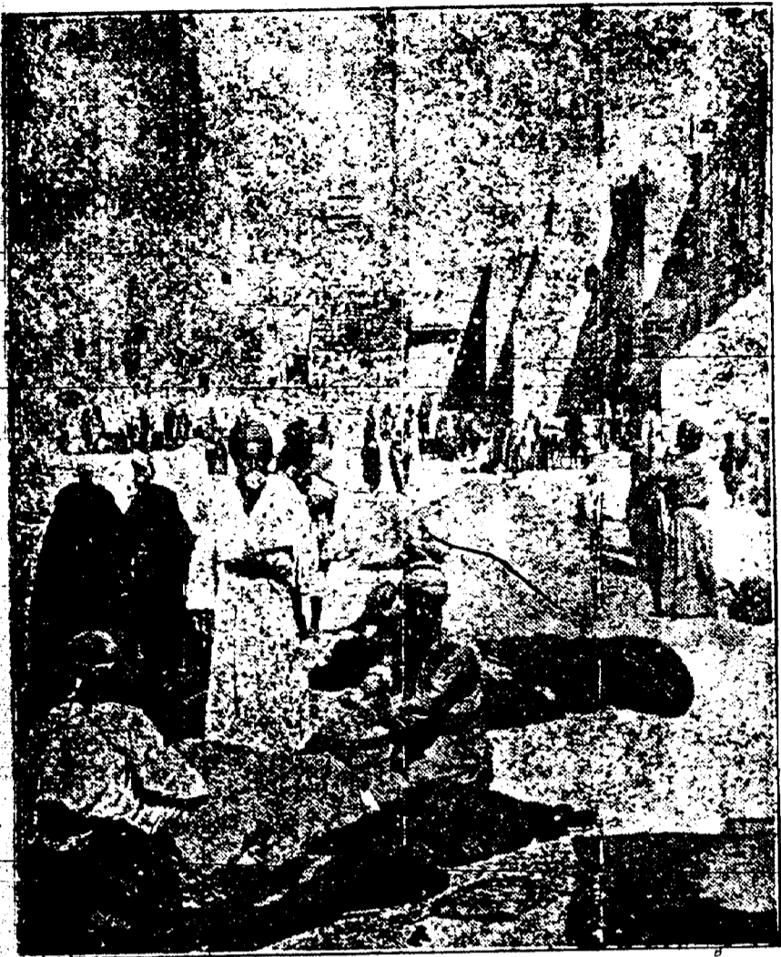
This is the place which Mary and Joseph saw crowded on the Holy Eve. The inn, where they found room in the stable, stood on the site of that church directly facing us across the square.